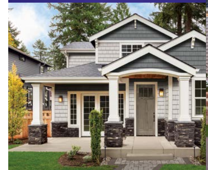
Portsmouth™ D5 Shake in Storm and Sterling, Trim in Antique White

For more information on installation instructions, product drawings, warranty documents and much more, visit us at RoyalBuildingProducts.com/for-professionals