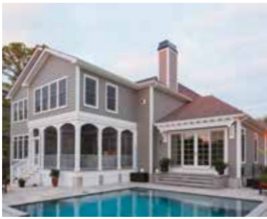
CELECT® CELLULAR COMPOSITE SIDING