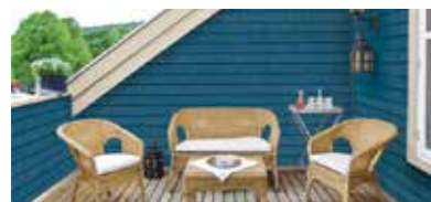
PORTSMOUTH™ SHAKE & SHINGLES