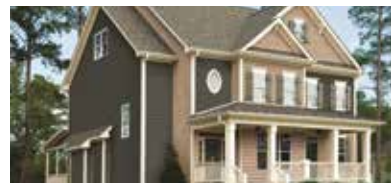
ROYAL® SHUTTERS, MOUNTS & VENTS