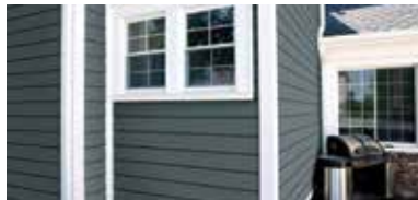
ROYAL® TRIM & MOULDINGS