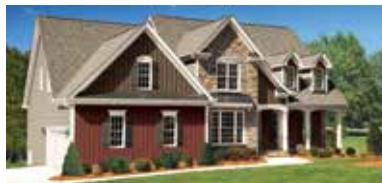
HAVEN® INSULATED SIDING