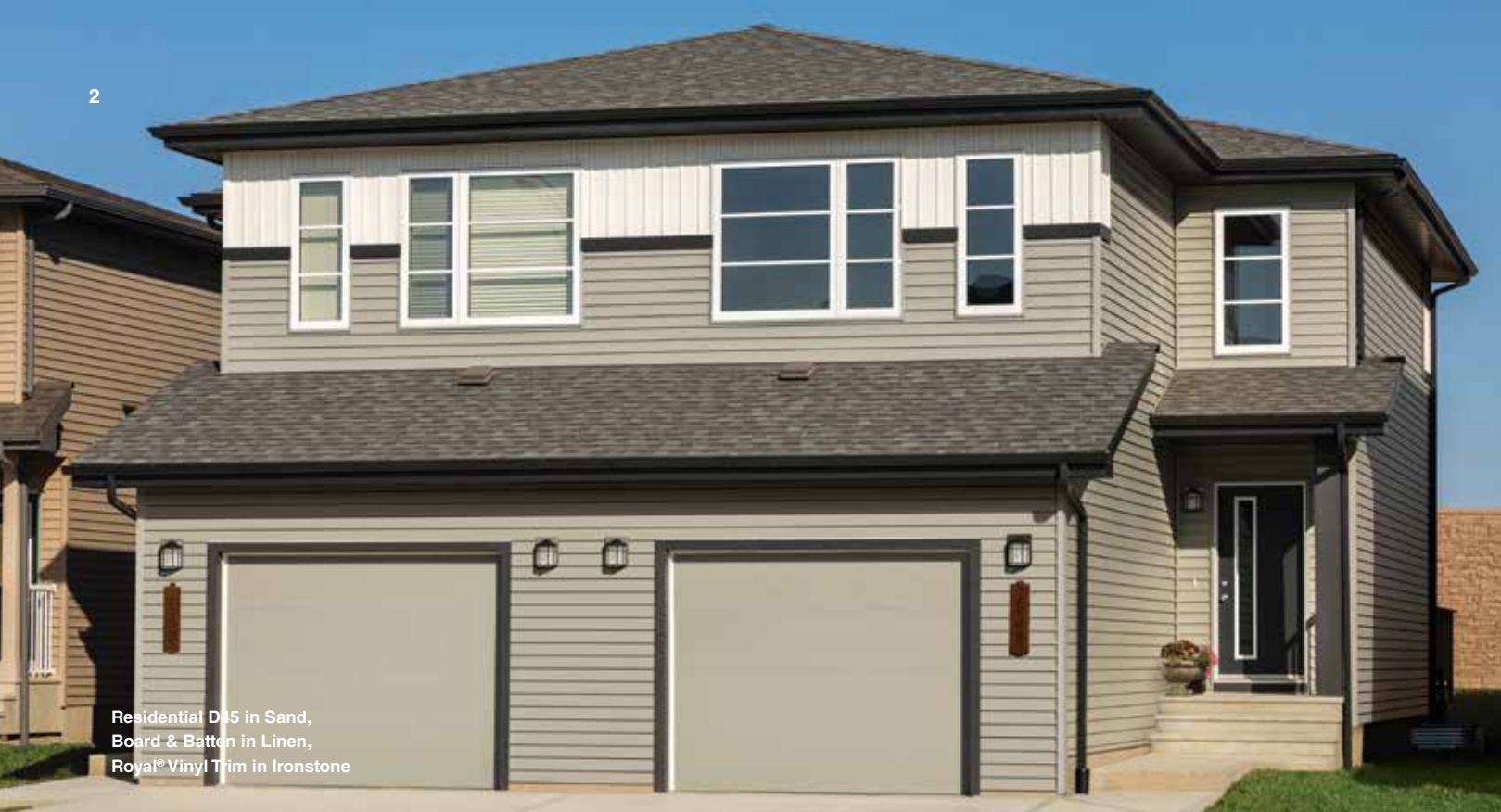
Residential D45 in Sand, Board & Batten in Linen, Royal® Vinyl Trim in Ironstone