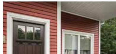
ROYAL® VINYL SIDING