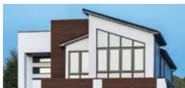
CEDAR RENDITIONS™ ALUMINUM SIDING