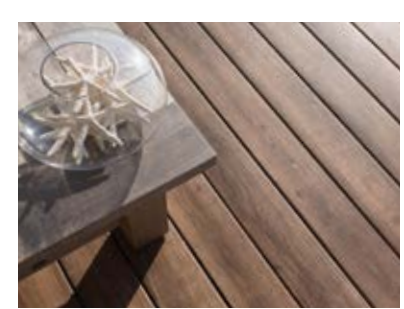
ZURI® PREMIUM DECKING