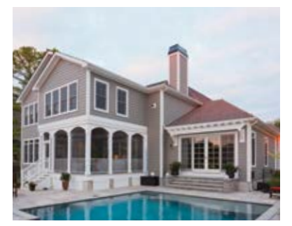
CELECT® CELLULAR COMPOSITE SIDING